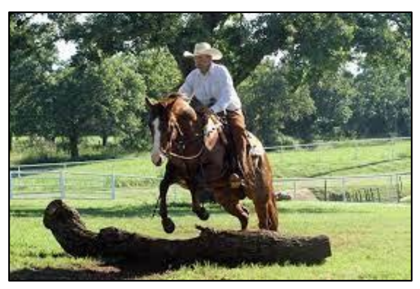
It's not to late to sign up- 2 openings left